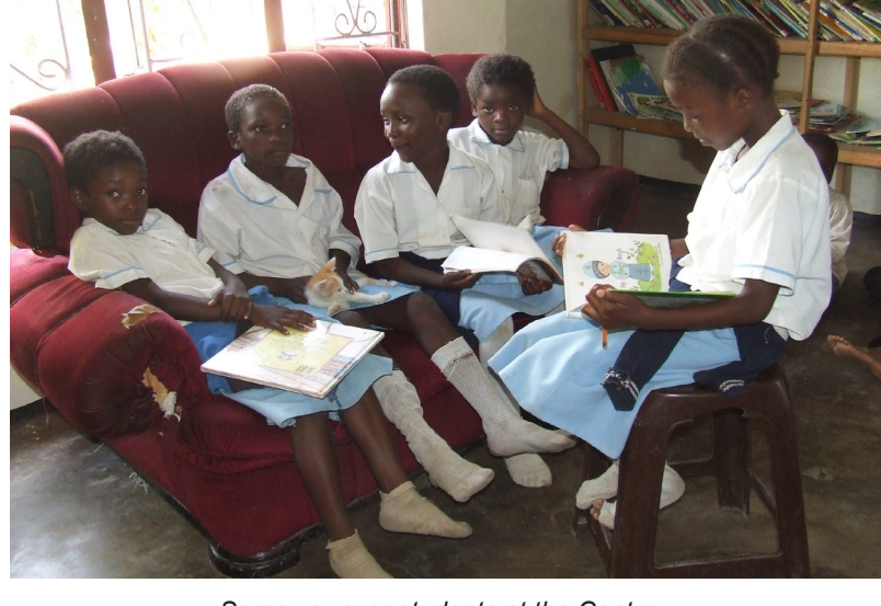
Some younger students at the Centre

The School year starts January 16th 2012 and 230 students are in need of sponsorship. We must raise at least $75,000 to ensure that these students continue their education!