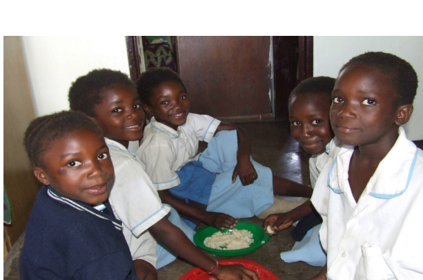
Breakfast Club at the Centre – The students share a plate

May we also ask you to kindly forward this newsletter to your friends and family who may be interested in our sponsorship program? All donations to AEP are tax-deductible.