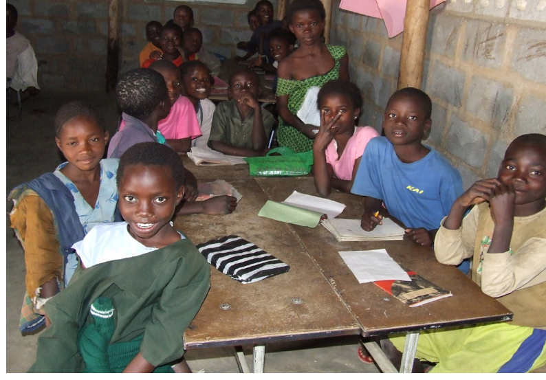
Community School in the village of Chanyanya

Rural Outreach Program: Your donation of $800 will give a student living in the rural village of Chanyanya the opportunity to attend high school and live in AEP's boarding house. Very few students in Chanyanya even dream of attending high school. AEP's ROP program is changing this trend!